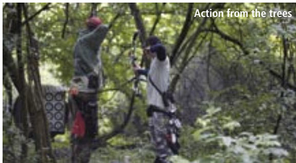
Action from the trees