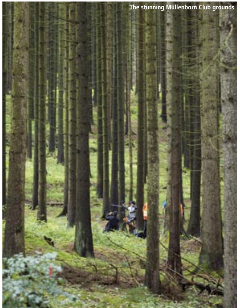
The stunning Müllenborn Club grounds